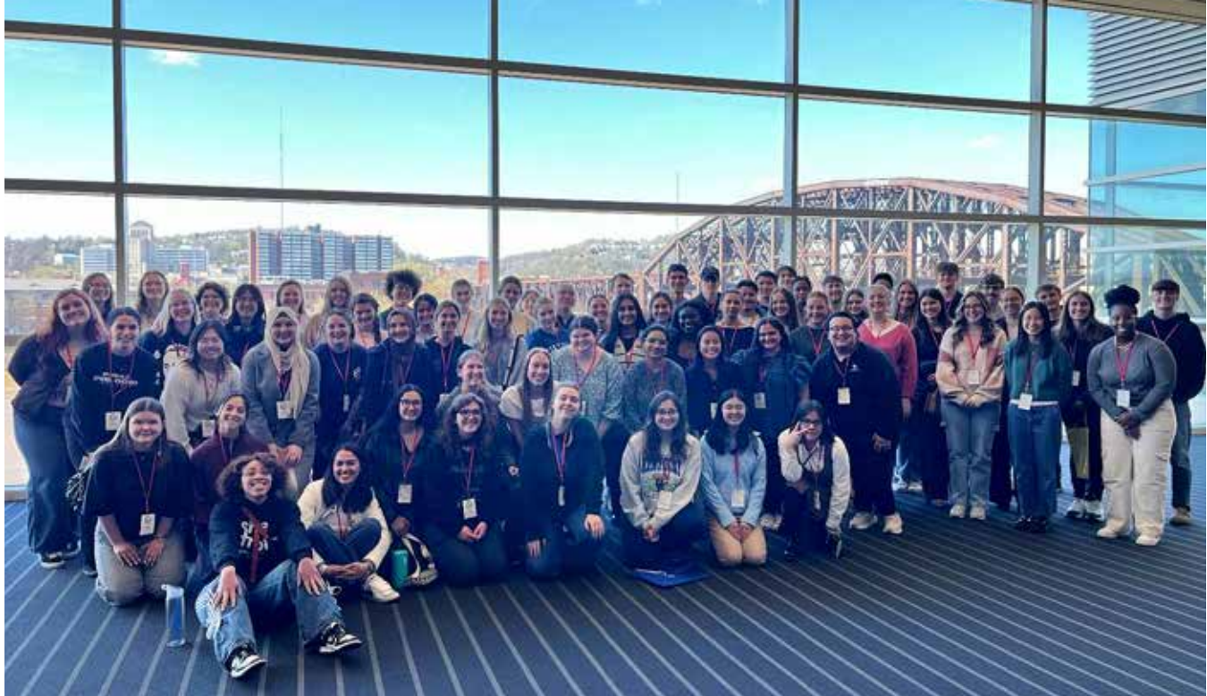
UK students at the NCUR 2025 Conference in Pittsburgh.