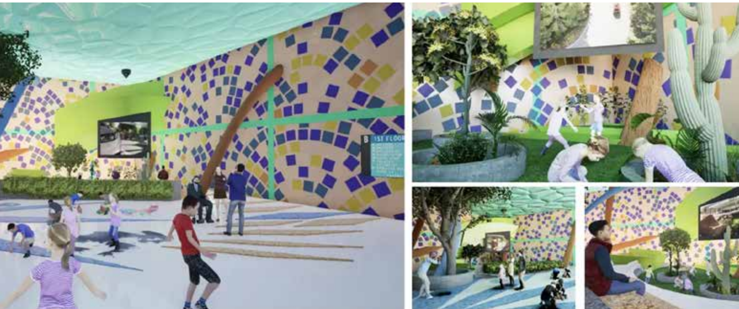
Nichols’ research explores how natural elements, interactive spaces and sensory engagement can reduce stress and anxiety for young patients.